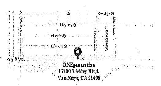
Parking for all attendees! Shuttle service to event every 5 minutes.